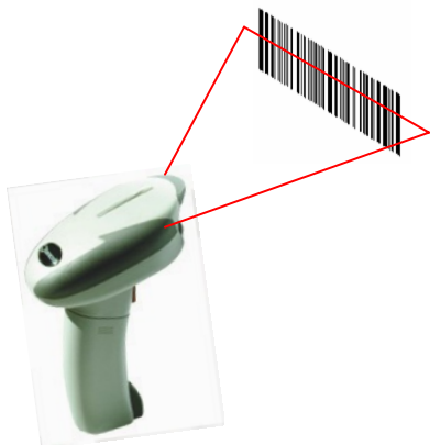
Sample Bar code

The scanner will emit a beep when the scan is successful.